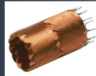
Self-supporting ironless winding type maxon

"Mounts are often bought separately from the telescope" explains Wally. "For instance, astronomical associations, colleges, institutes etc. buy telescopic equipment separately from the mount then assemble the two themselves." Astro-Physics' telescope mounts 3600GTO and 3600GTOPE are used in many private homes, universities, research institutes and educational establishments, astronomical associations, joint organizations or in solar technology companies.